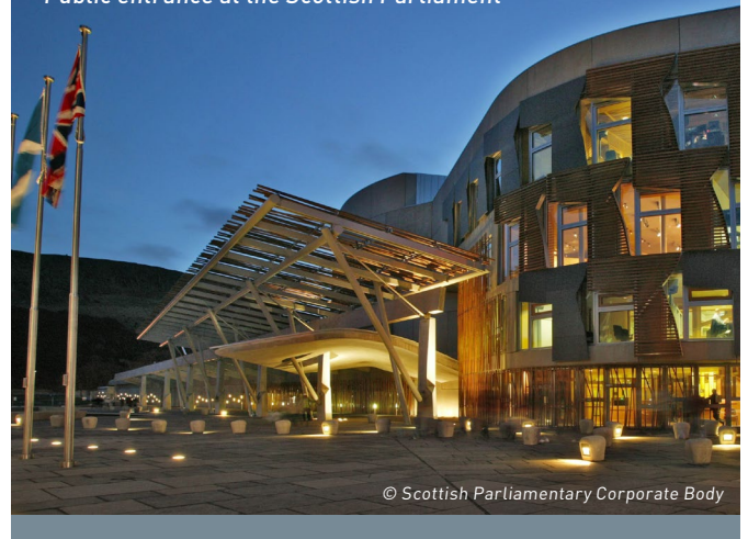
Public entrance at the Scottish Parliament