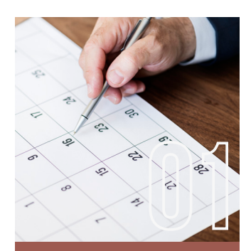
Surveillance Audit Annual audit for certified participants.